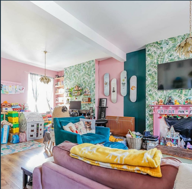
Comments by the Homeowner

All measurements are approximate and for display purposes only